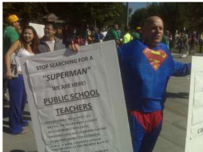
Protesting Waiting for Superman