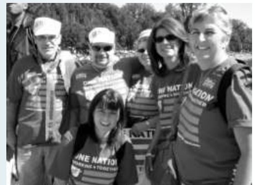
Protesting the treatment of immigrants and the assumption that many Latinos are illegal.