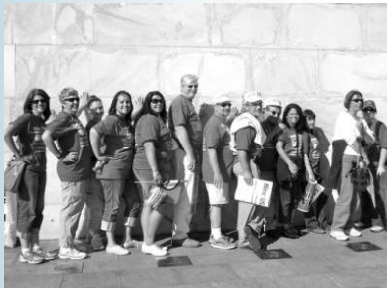
Near day's end: WCT holding up the Washington Monument

I decided I would march in the early spring when I heard Randi Weingarten, President of the AFT, speak at an ED 13 meeting. It was my chance to not only use my mouth but my feet. Weingarten called on NYSUT members to turn out in force to support public education. I believe in public education. I believe that it was meant to be the great equalizer for all children in this country. I believe that whether you live in New Orleans or Fishkill the quality of a public education should be equally rigorous. As the months passed I began to hear more about this One Nation March for not just education, but jobs and social justice. The connection made sense to me. A week before the march Waiting for Superman was released and I knew I had made the right decision to take 24 hours of my weekend and actively express my support for not only my students but also my colleagues. As an active member of the WCT, I have seen that teacher unions don't just protect teachers; they protect students.