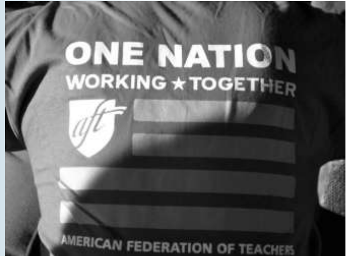
Unifying tee shirt worn by all WCT members

Why I marched on 10/2/10: Although I am not a teacher, I have worked for 22 years in the public school system, mostly as Secretary to the Superintendent. In that time I have seen how the education field is having more and more demands placed on it, teachers being under attack for things they cannot control and funding being pulled away. Teaching is a very important job and a difficult one. New York State is one of the most stringent states for certification of teachers. As in any profession, there are always a handful that are not the best. Unfortunately, those are the ones everyone seems to hear about. I marched in support of the public education system, to make our voices heard to improve our education system and to support the unions. Unions are fighting to get more money for our schools and improve education for all of our youth, our future.