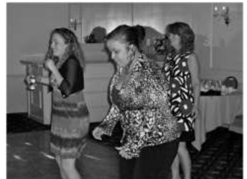
The Cha Cha Sliders

Frank Sinatra’s “My Way” to Lady GaGa’s “Poker Face” to the “Cha Cha Slide.” The Bee Gees “Staying Alive” got many onto the dance floor as the dancers danced their way back to the 70s. A microphone was passed around among the various dancers who became singers with Joan Jett’s “I Love Rock n’ Roll” (names withheld). Meatloaf’s “Paradise by the Dashboard’s Life” was the cause of a sing-off between several male and female attendees (names withheld).