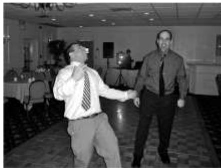
The Last Revelers