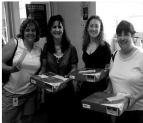
Ready to Mail the Take One! Boxes Candidates at the

the process depends on personality. Therefore, if you are a person who tends to dive into a project with the end goal in close proximity then