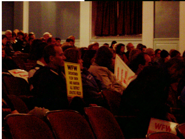
(Left - WFW members at the board meeting.)